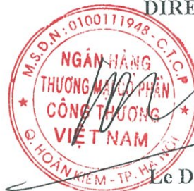
Le Duc Tho